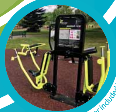
Free session voucher included in programme