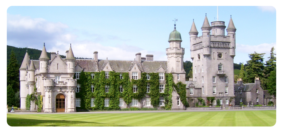
Balmoral Castle is in Aberdeenshire, Scotland.