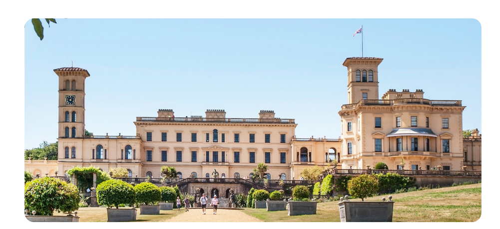
Osborne House is on the Isle of Wight, England.