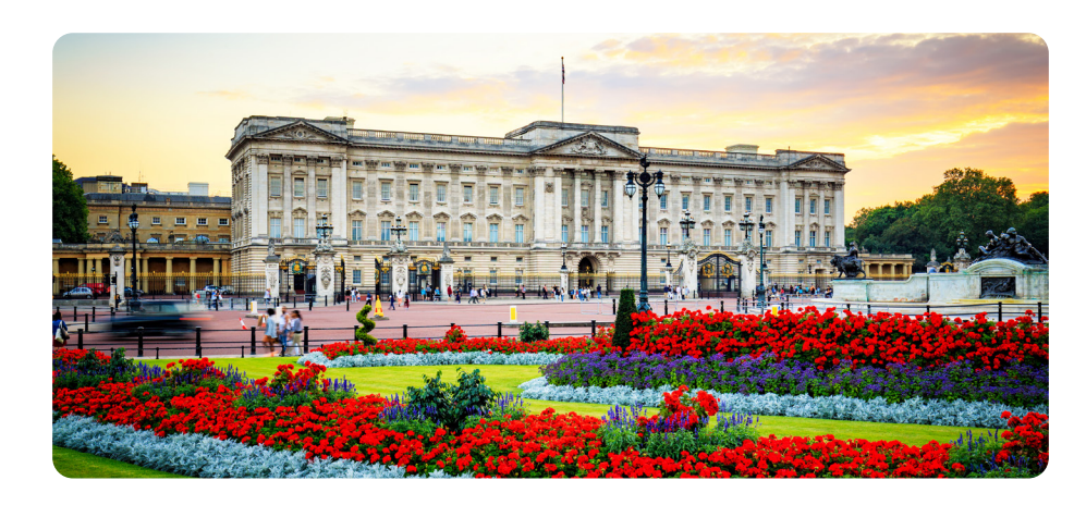
Buckingham Palace is in London, England.

Royal residencies include palaces, castles and stately homes. Some of them are used for official royal business. Some are used as holiday or private homes. Many are tourist attractions.