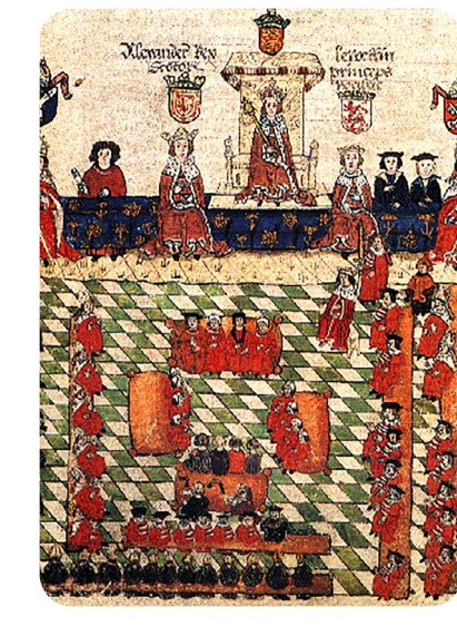
Edward I and the Model Parliament

The power of the monarchy has changed over time. In the past, some monarchs had absolute power. This meant that they could do whatever they wanted. Today, there is a constitutional monarchy. This means that the monarch is controlled by parliament and the government.