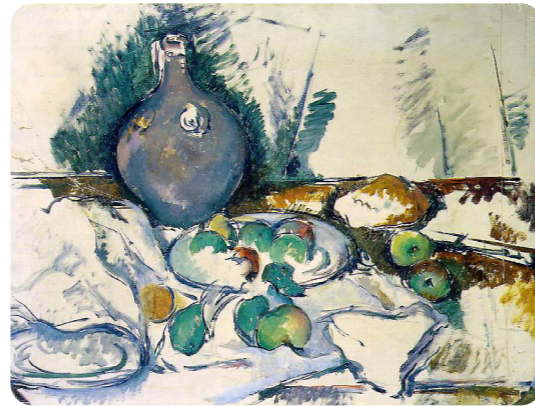
Paul Cézanne painted the apples in the foreground and the jug in the background in this painting.

Artists arrange objects in their artworks carefully. They decide which objects will go in the foreground or background of the work. They also think about the size of the objects they have chosen.