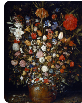
Jan Brueghel the Elder painted large flowers at the top of the vase and small ones at the bottom.