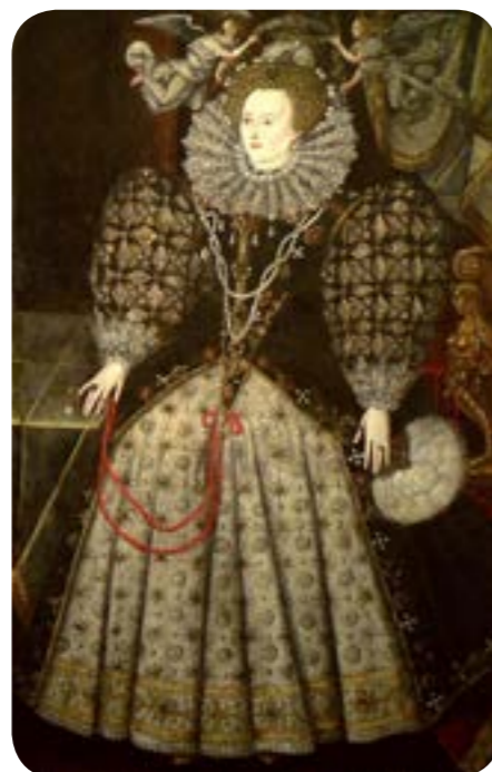
Portrait of Elizabeth I of England attributed to Nicholas Hilliard, 1590