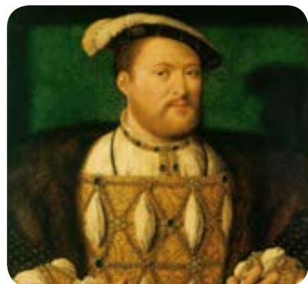
Portrait of Henry VIII by Joos van Cleve, c1530–1535

A portrait is a painting or photograph of a person. It usually shows their head and shoulders, but may show their whole body. Before cameras were invented, kings and queens often had official portraits painted to show how powerful and important they were.