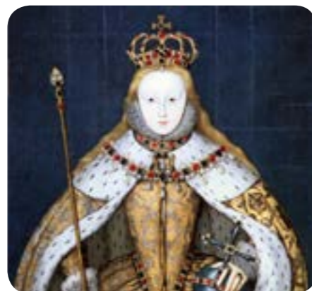
Coronation Portrait by unknown artist, c1600