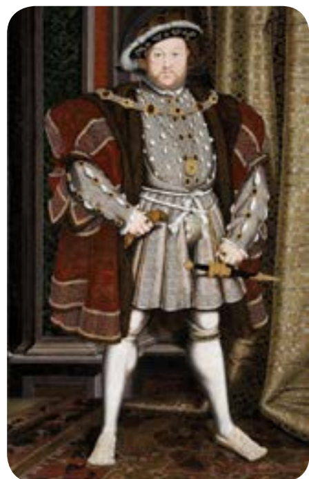
Henry VIII by Hans Holbein the Younger, 1537–47