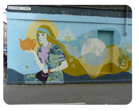
The Gifford Park mural by Kate George, 2015

A mural is a large picture that is usually painted onto a wall, ceiling or other structure.