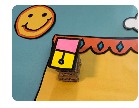
Five layers of cardboard make this window stand out.

Layers of corrugated cardboard can be glued to the back of cut outs to create a 3-D effect.