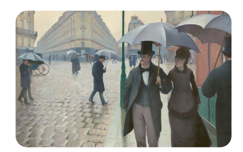
Paris Street; Rainy Day by Gustave Caillebotte, 1890