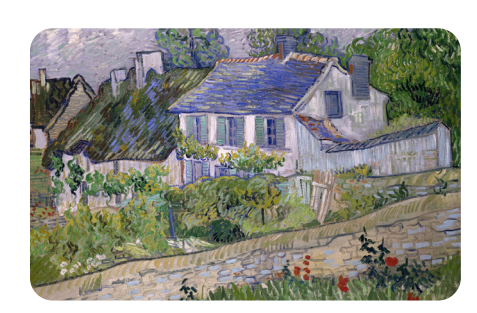
Houses at Auvers by Vincent van Gogh, 1890